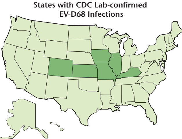
From mid-August to September 12, 2014, a total of 97 people in Colorado, Illinois, Iowa, Kansas, Kentucky and Missouri have been confirmed to have respiratory illness caused by EV-D68. Many more are believed to be infected.

It is not clear why the sudden outbreak of this virus has occurred. But its continued spread likely does relate in part to the return of school as children spend more time together. This trend is similar to the increase in cases of influenza that are seen when students go back to the classroom after winter break.